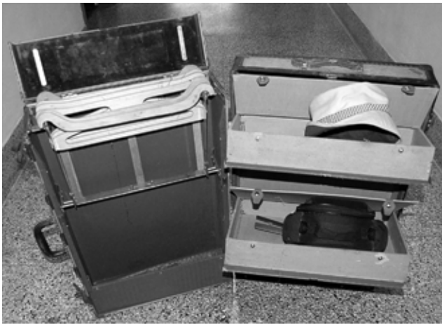
A World War II traveling trunk used by Pearl Ellis