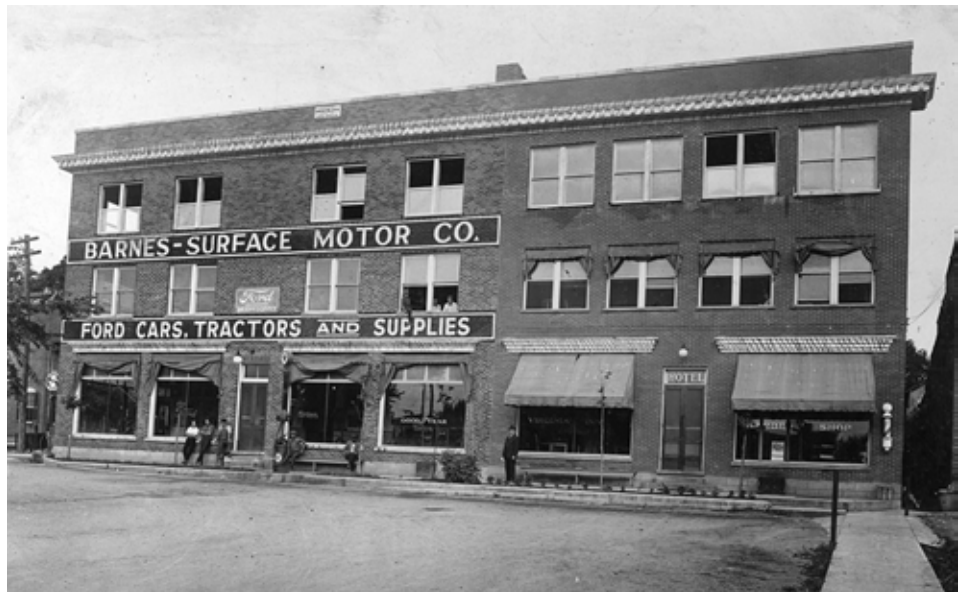
The Barnes-Surface Building and Hotel in the early 1920s