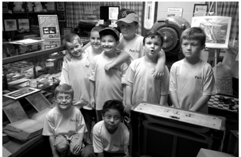
The Tiger Den of the Cub Scouts, Pack 720, of Eastern Montgomery County visited the museum on September 12th.

We wish to thank all the people who contacted the museum regarding Kirk Hollow. Meadowbrook Museum is open 10 am to noon Wednesdays and Saturdays. Contact us at 268-5047 or berrypatch12@verizon.net .