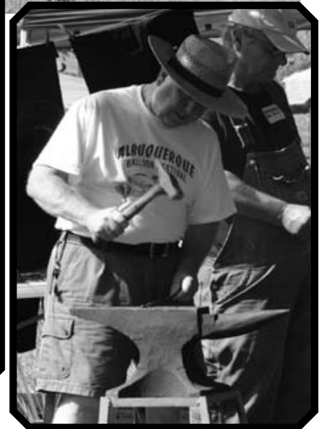
Events from last year's Heritage Day