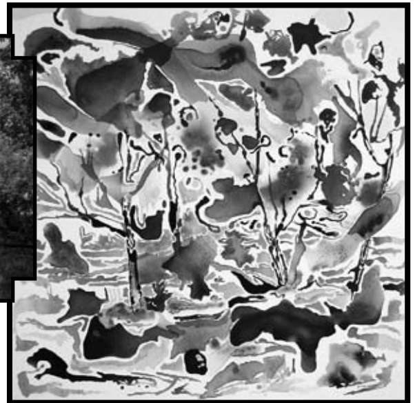
A Painting from the Evaporation Series