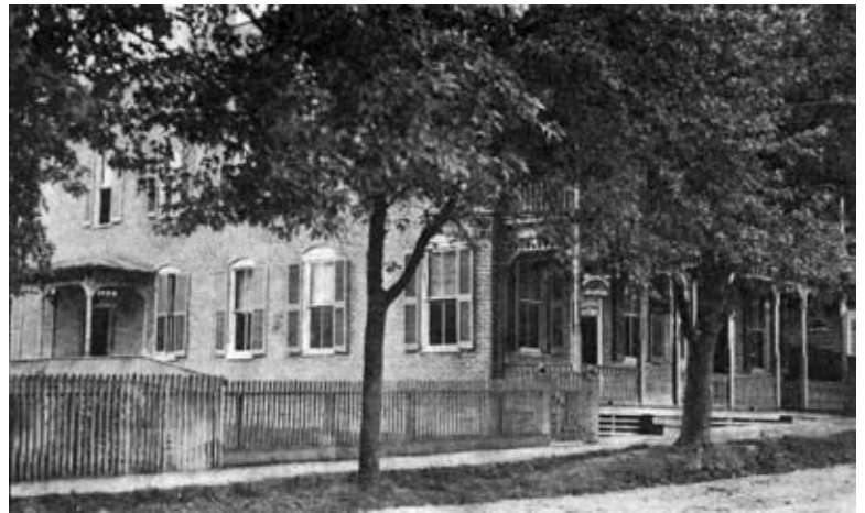
The Old Clerk's Office in 1908

In the June 1988 registration form seeking placement on the National Register of Historic Places for The Old Clerk's Office, architect Gibson Worsham points out that "the Phlegar Building is significant . . . as the county's best example of a late nineteenth-century law office." He adds, "In addition, the building incorporates recognizable, formal, and material elements of the early nineteenth-century county clerk's office."