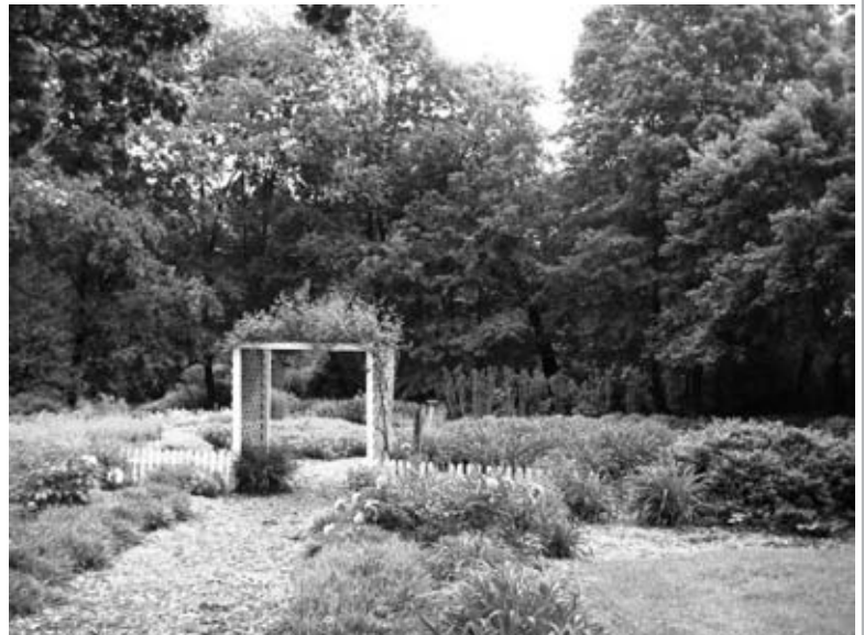
Montgomery Museum Garden